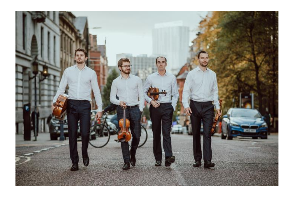
Elmore String Quartet, playing Sunday 20th February. Get your tickets soon!