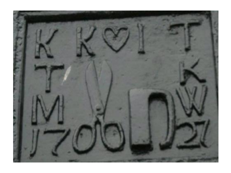
The marriage stone at 7, Braehead: come find out more on Thursday 17th February at the Old Brewery!

Well, that's all we have folks! Here's hoping everyone stayed safe during the storms, and that your 2022 is shaping up to be a great year.